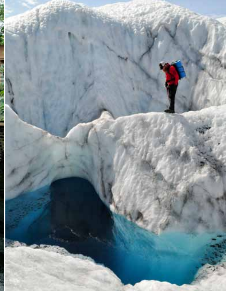
CLOCKWISE FROM TOP LEFT: Kayakers explore the historic red light district in Ketchikan, Alaska, one of the stops on the ferry ride to Skagway; a hiker surveys Root Glacier in Wrangell-St. Elias National Park; a black bear takes a meal break at Allison Point, near Valdez; and a look at Worthington Glacier atop Thompson Pass, also near Valdez.